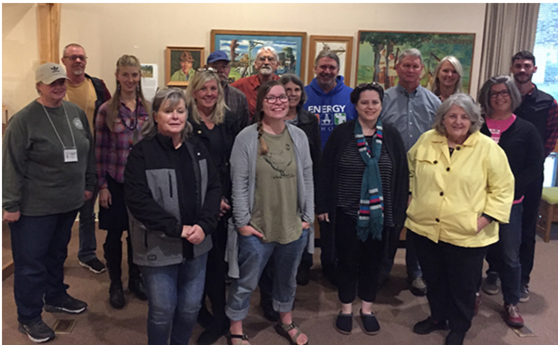
This happy bunch of folks recently completed their Master Gardener training class via