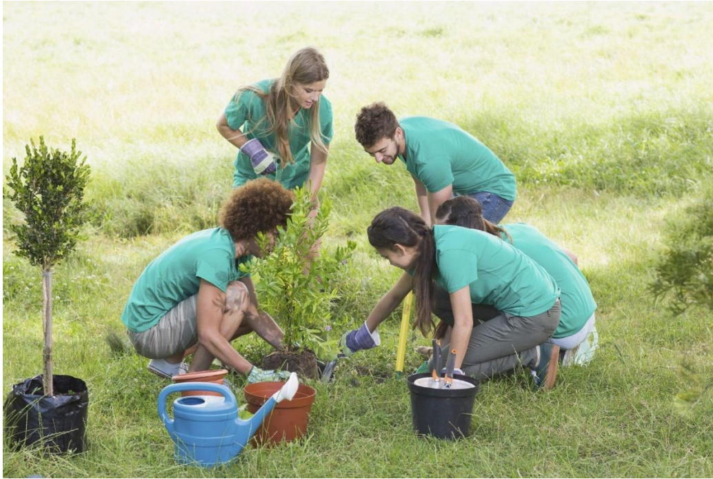
ACMGs and volunteers from Nutrition Warriors and Junior Service League plant trees in the Zeta Community Garden on 9/28/2022.