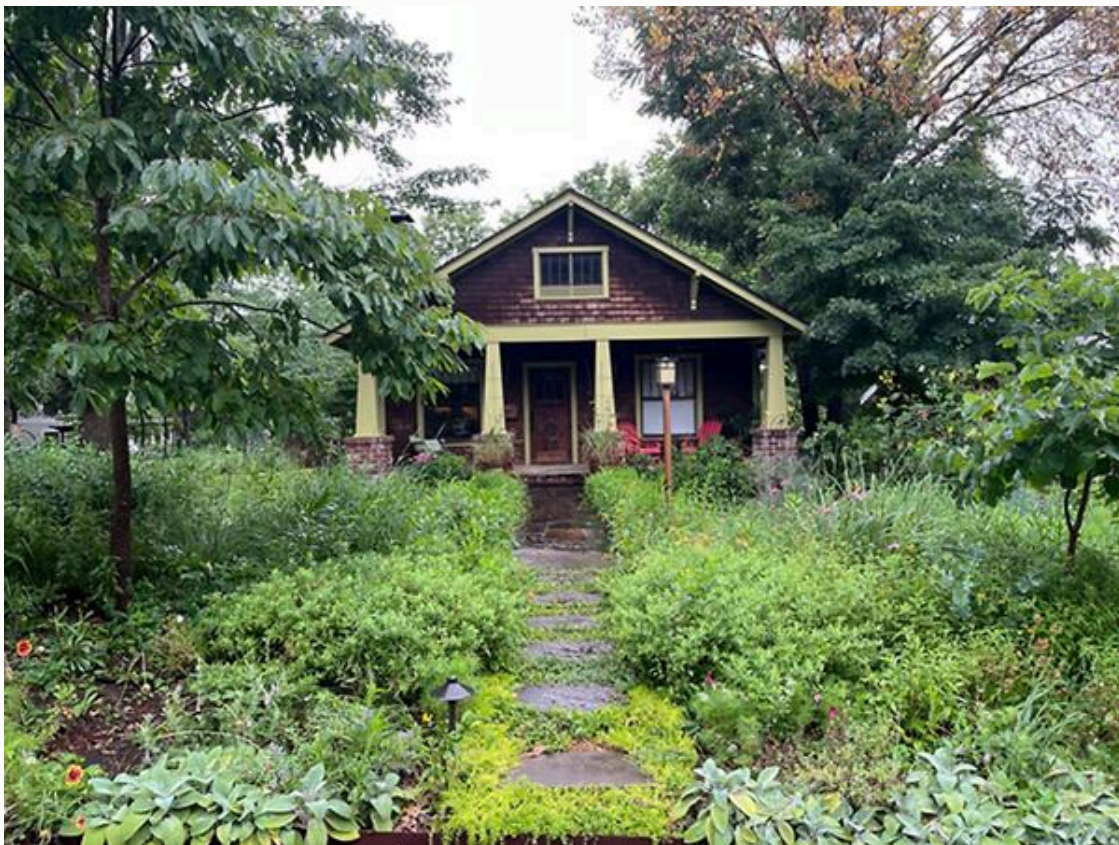
"Jardin Aceituna," one of the locations on the 2026 Garden Gate Tour.