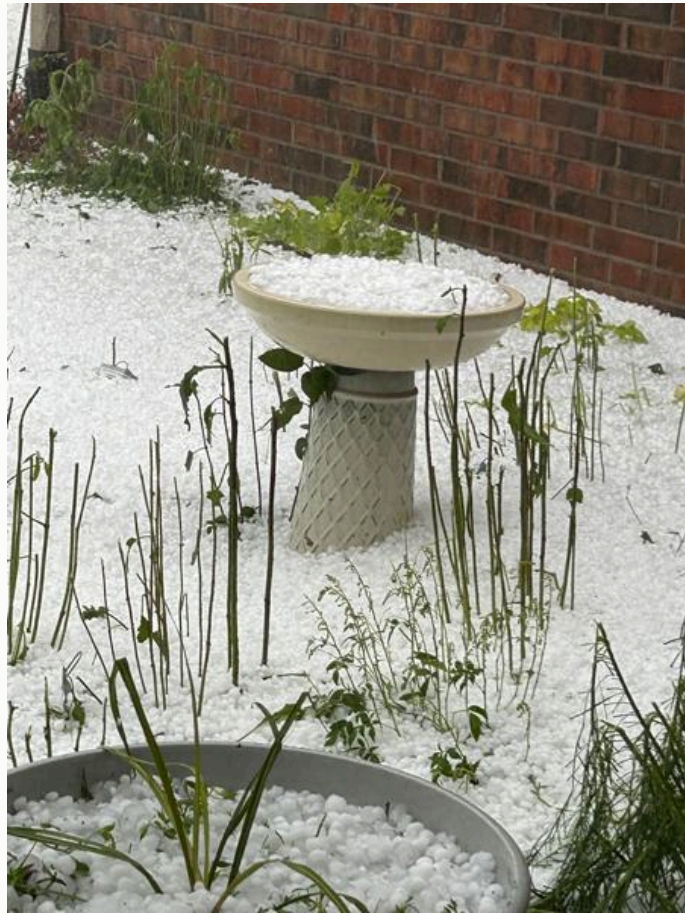
Spring 2026 in Pam's Garden